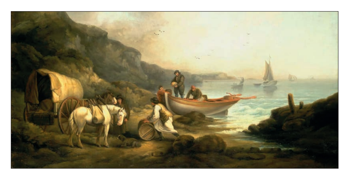
[A painting of smugglers in the late eighteenth century]